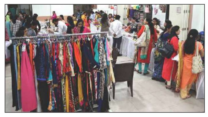
Stalls at 'Women's Entrepreneurs Expo'