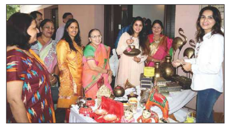
Dignitaries at 'Women's Entrepreneurs Expo'