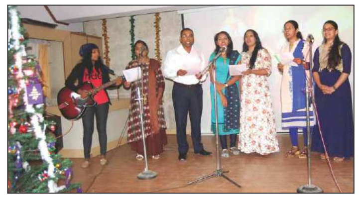
Carol singing by the students during Christmas Celebrations